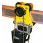
Geared Trolley with Chain Hoist