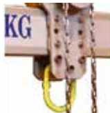
Geared Master Link