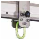
Standard Master Link